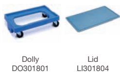
Dolly DO301801 Lid LI301804