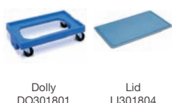
Dolly DO301801 Lid LI301804