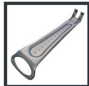
Handle available: H0008604